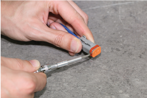
Terminal & Connector Tool Set 5pc | 7807