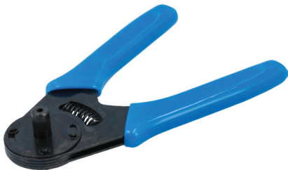
4 Way Indent Crimping Tool | 7533